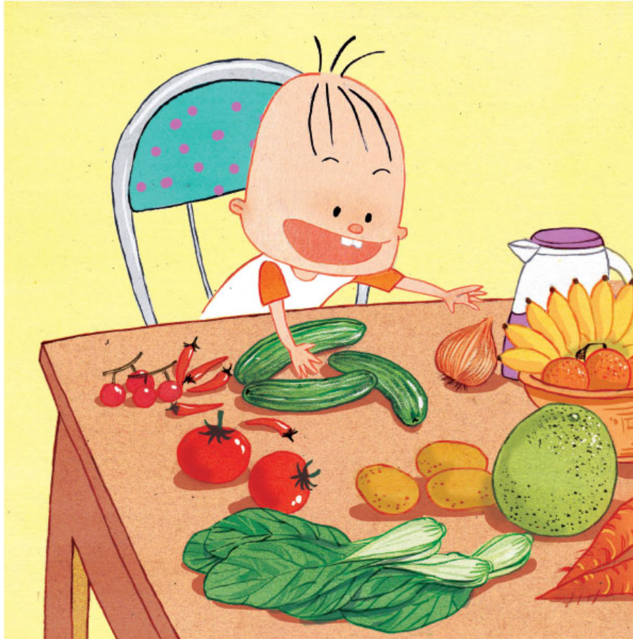
Tomato Nhã Thuyên